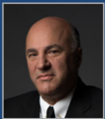
Kevin O'Leary MBA, Chairman, O'Shares ETF Investments, and Star, ABC's Shark Tank