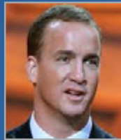
Peyton Manning NFL Legend