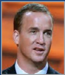
Peyton Manning NFL Legend