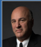
Kevin O'Leary MBA, Chairman, O'Shares ETF Investments, and Star, ABC's Shark Tank